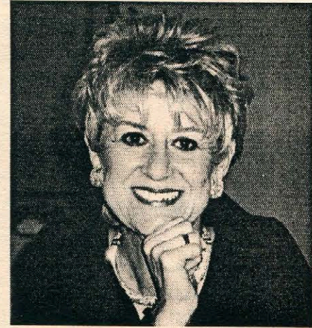
Director of Nurses