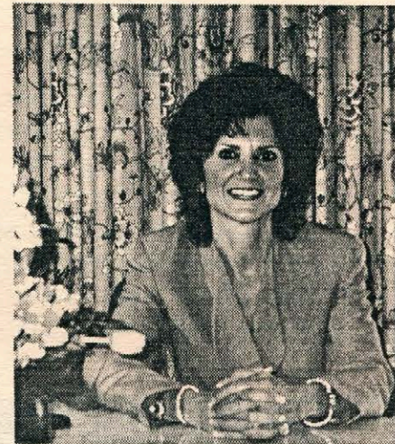
Director of Marketing